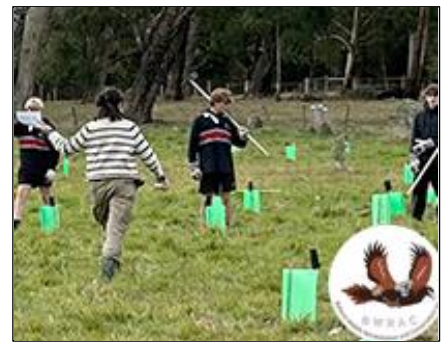
Students Planting Day